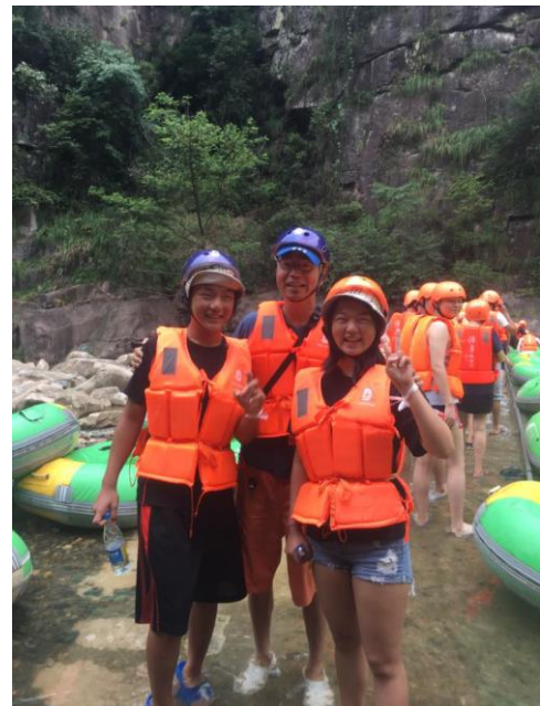
... und auf Reisen in der eigenen Heimat.